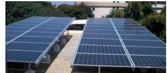
24kWp, Roof-top, Bangalore, Commissioned in 2013