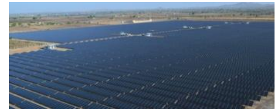
10MWp, Rajkot, Gujarat, Commissioned in 2011