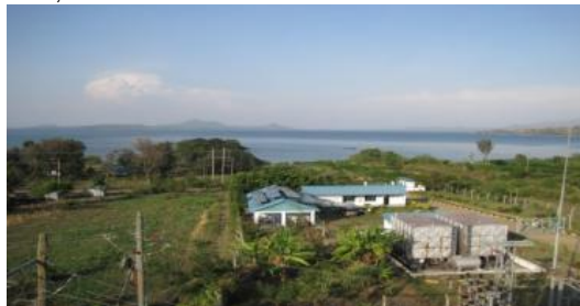
Mini Grid in Kenya with Solar Fuel Saver.

The Solar Fuel Saver is the perfect solution to cut down power generation costs for all kinds of applications in sunny regions. It is ideal for industrial customers with large parts of their load in the daytime or mines that are remote from the public grid. Also companies in the manufacturing sector and tourist resorts that are dependent on reliable electricity supply will benefit significantly from juwi's SFS,solution.