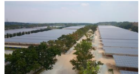
10MWp, Carport, Kuala Lumpur, Malaysia, Commissioned in 2013