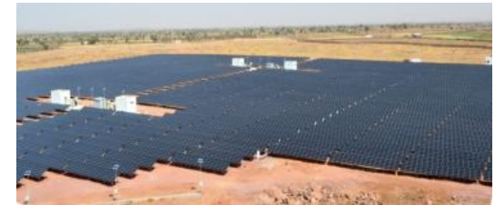
5.2MWp, Jodhpur, Rajasthan, Commissioned in 2011